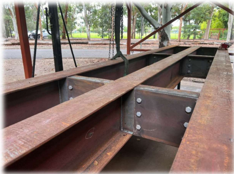
Construction 300 Steel Universal Beams

This construction was overseen by Empire Engineering as the consulting authority who approved the drawings and made amendments where necessary. As you can see it is a very strong design